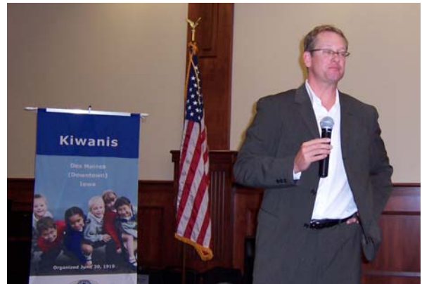
Nick Nurse, coach of the Iowa ENERGY, pauses before he answers one of many questions from members who were most interested in how he will staff this new NBA development team.